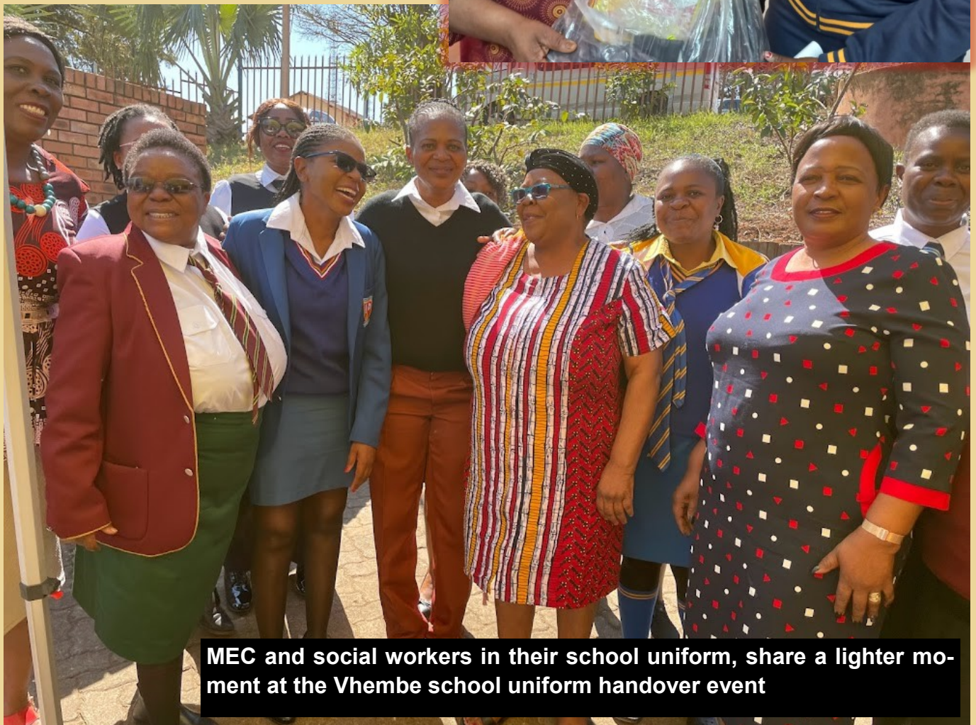
MEC and social workers in their school uniform, share a lighter moment at the Vhembe school uniform handover event