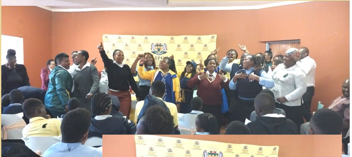
Top and right: A festive atmosphere at the Vhembe edition of school uniform handover, in Mulima village, Makhado Municipality.

MEC Ndalane, in addressing the various learners, parents, principals, SGBs and dignitaries in attendance, related that on our way to work in the mornings, we all see learners in uniform, and we usually take for granted that they have adequate school clothes: "School uniforms are an integral part of the school experience. Not only do they provide a sense of unity and belonging for learners, but they also create a sense of pride and responsibility.